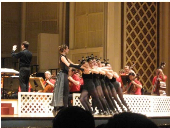
CCM Prep Youth Ballet Company performing with the CSO on Saturday, February 21 as part of the Fine Arts Fund Sampler Weekend