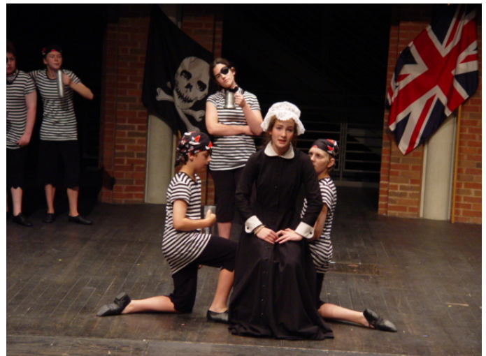
2008 Camp Curtain call "Pirates of Penzance, Jr."