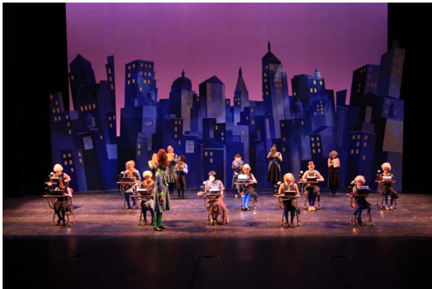
CCM Prep Theatre Arts Production of "Thoroughly Modern Millie, Jr."