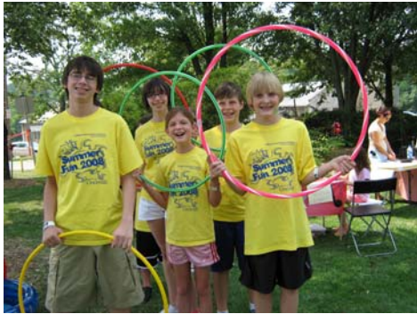
Camp Curtain Call performers having fun at the Hitchens Fundraiser, July 19

Thanks to all performers, volunteers and those who donated for our Hitchens Scholarship Fundraiser on July 19. We raised over $2,000 which will help provide scholarships for next year's summer camps!