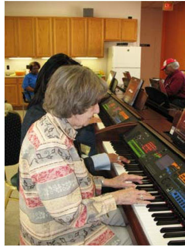
Students at the Over-the-Rhine Senior Center

is a keyboard program for seniors that emphasizes health and wellness. This is a partnership with the Council on Aging of Southwestern Ohio, the Yamaha Corporation of